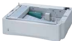
KX-FA101E Lower Input Tray (500 sheets)