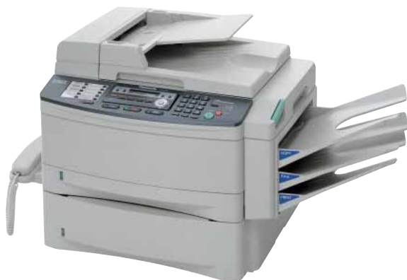
KX-FLB852CX with KX-FA101E