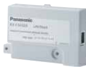
KX-FA102E LAN Board